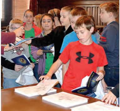
Court activity sheets as part of Statehood Day.