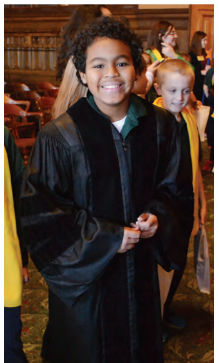
Hoosier students participated in judicial branch education at the State House.